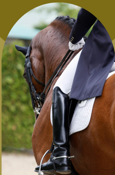
San Luis Obispo Chapter of the California Dressage Society

The California Dressage Society, formed in 1967, is a non-profit organization to further the interest in the equestrian sport called Dressage. It is the largest dressage organization in the nation with more than 3,000 individual members in its 30 Chapters.