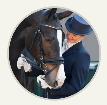
Events MULTIPLE EVENTS ANNUALLY WITH ATTENDANCE OPEN TO OVER 3,000 MEMBERS ACROSS CALIFORNIA